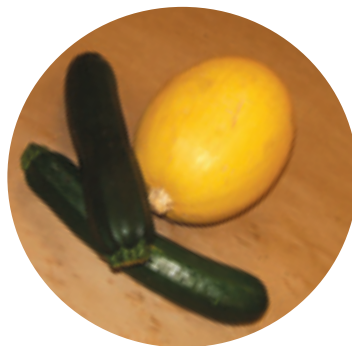
Yellow/Summer Squash & Zucchini

Good source of Potassium, Vitamin C & Folic Acid.