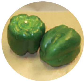
Pepper (green bell)

Very good source of Vitamin C. Also contains Vitamin A & Potassium.