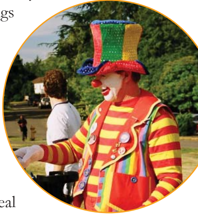
Clowning around at the Block Party

Earlier this year, staff of Windermere Real Estate spent their Community Services Day assisting with Spring cleaning at Sand Point. Over 40 volunteers came out to help paint both Santos Place and Family Housing as well as paint and clean at each of the three group homes. It was a lot of work, but the Windermere staff gladly took on every project we had. Thanks to their hard work, all of our buildings are looking fresh and new!