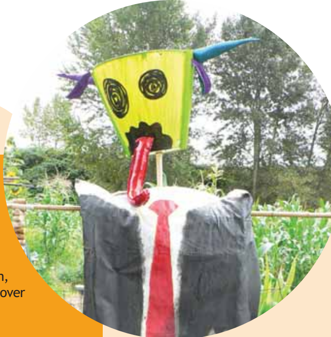
One of the scarecrows created by Coyote Central and children from Rainier Vista. Temporarily placed at Marra Farm, the scarecrows will move to the new Seattle Community Farm at Rainier Vista later this year.

Cool: Artists of Coyote Central, a nonprofit that recruits professionals from creative fields to share their talents and workplaces with adolescents, worked with the kids of Rainier Vista to create stunning scarecrows for our farm projects ( see photo ). ●